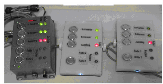
CD-SCS German navy tested Prototype

The Combat Diver – Submarine Communication System CD-SCS is a system with 3 panels which allows a safe and clear communication between combat divers and chief engineer. It was performed